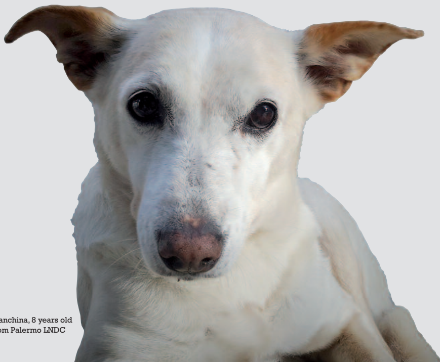
Bianchina, 8 years old from Palermo LNDC